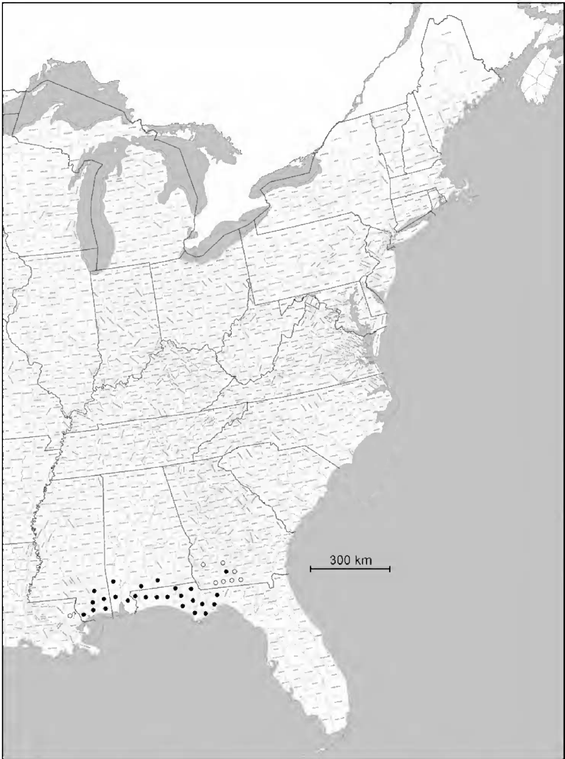
Figure 1: A 2010 snapshot of the range of Drosera tracyi . Counties or parishes believed to currently maintain native populations are indicated by a black dot. Counties where it is believed D. tracyi has been extirpated are indicated by an empty circle. The question mark for the Louisiana site notes that it has not been confirmed that Drosera tracyi has ever occurred there.